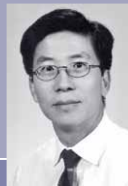
Professor of Surgery