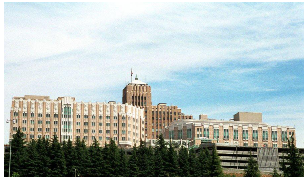
Trauma & Burn Surgery Division at Harborview Medical Center