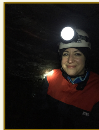
Lava tubes adventures in Iceland