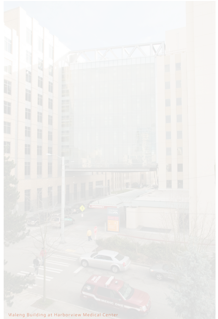
Maleng Building at Harborview Medical Center