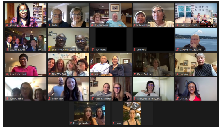
DOS chief residents virtual graduation event